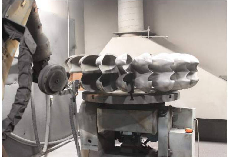
Pelton Runner Surface Solutions. Result: Double the lifespan.