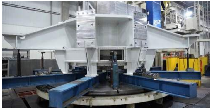
Lower Bracket pictured on TSS